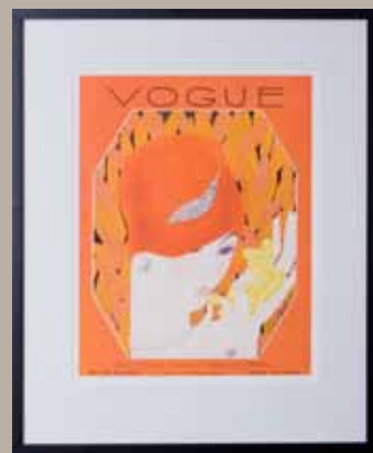
Georges Lepape, Vogue/August 1927, Open edition giclee print 21st Floor West Corridor