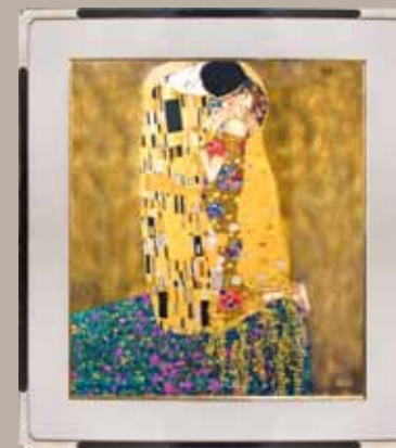
Gustav Klimt, The Kiss, Silk scarf 1st Floor Bathroom