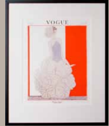
Georges Lepape, Vogue/November 15, 1922, Open edition giclee print 21st Floor Elevator Lobby