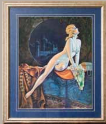
T. Anew Hesser, Persian Nights, Open edition lithograph 12th Floor Corridor East