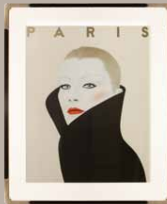
Gérard Courbouleix, Preta a Porter Feminin, Open edition poster lithograph 23rd Floor Elevator Lobby