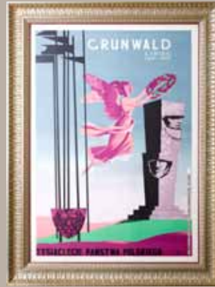
Tadeusz Gronowski, Grunwald Lipiec, Reproduction poster 17th Floor Elevator Lobby