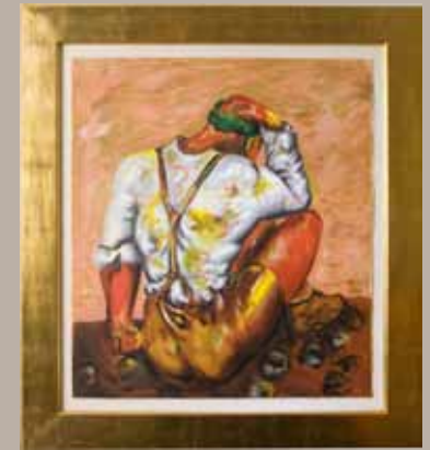
Sandro Chia, The Lonely Explorer, Limited edition lithograph 24th Floor East Corridor