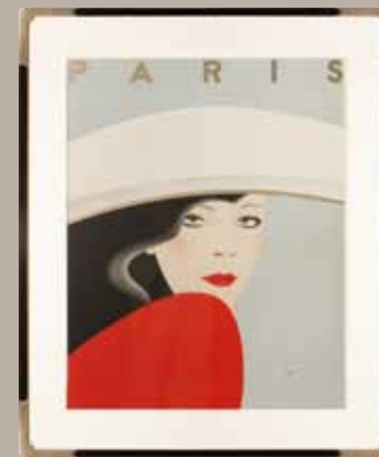
Gérard Courbouleix, Paris: Haute Couture, Open edition poster lithograph 23rd Floor Elevator Lobby