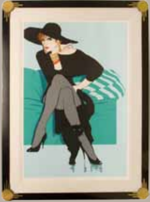
Limited edition lithograph 23rd Floor West Corridor