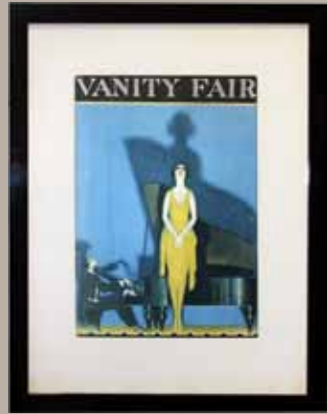
William Bolin, Vanity Fair June 1921, Reproduction illustration print 6th Floor Club Room