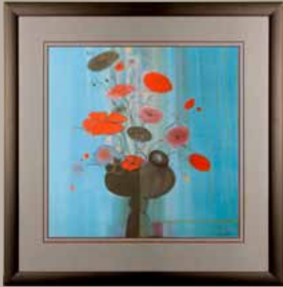
Patricia Buckley Moss, Red Flowers, Open edition lithograph 16th Floor Elevator Lobby