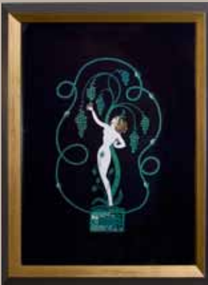
Erté, Emerald, Open edition lithograph 9th Floor Elevator Lobby