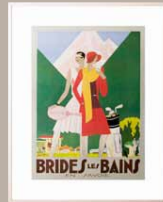
Lèon Benigni, Brides Les Bains, Poster reproduction 6th Floor Restrooms