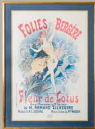
Jules Cheret, Folies Bergère: Fleur de Lotus, Poster lithograph 6th Floor Billiard Room