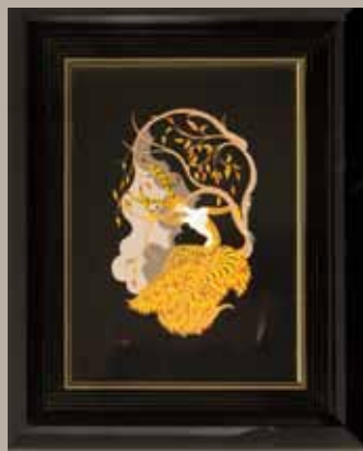
Erté, Autumn, Glazed ceramic 25th Floor Corridor West