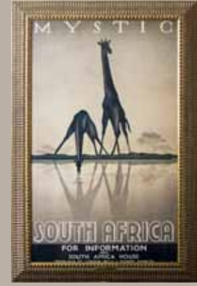
Gayle Ullman, Mystic South Africa, Reproduction poster 13th Floor Elevator Lobby