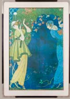
Unknown, Unknown, Vintage poster lithograph 12th Floor Elevator Lobby