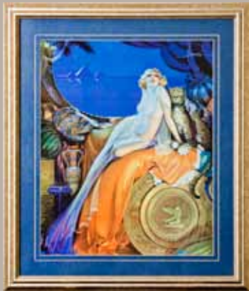
Rolf Armstrong, Cleopatra, Open edition print 12th Floor Corridor East