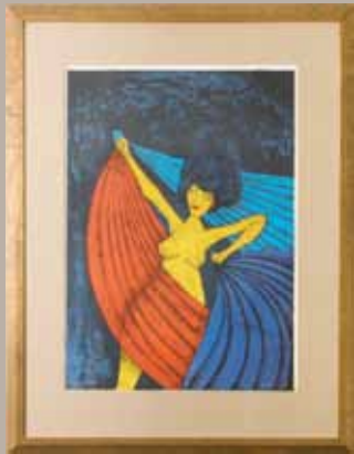
Rufion Tamayo, Salome, Limited edition lithograph 26th Floor West Corridor