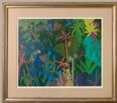
Gustav Liken, Jungle with Birds, Lithograph 18th Floor Elevator Lobby