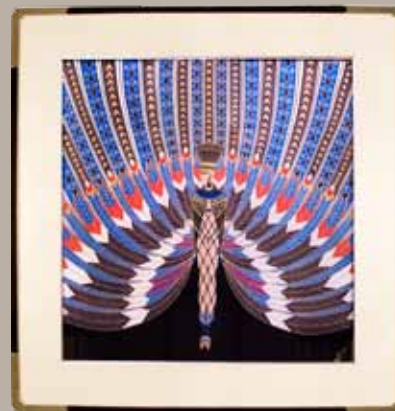
Erté, Nile, Silk scarf 1st Floor Elevator Lobby