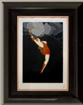
Erté, The Dancer, Limited edition serigraph on paper 1st Floor West Corridor