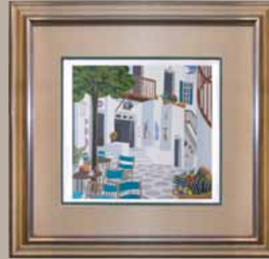
Thomas McKnight, Street, Limited edition serigraph 10th Floor Elevator Lobby