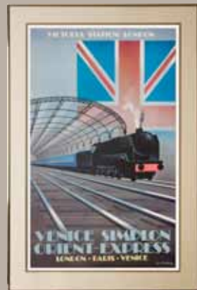
Pierre Fix-Masseau, Victoria Station London Venice Simplon Orient-Express, Poster lithograph 19th Floor Elevator Lobby