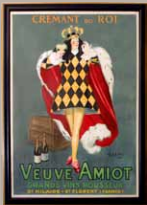
Leonetto Cappiello, Veuve Amiot, Vintage poster lithograph 1st Floor Vestibule