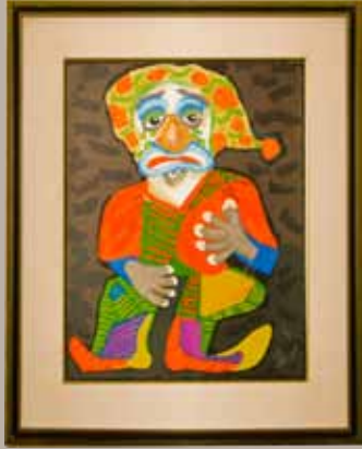
Karel Appel, Pagliacci, Limited edition serigraph 26th Floor East Corridor