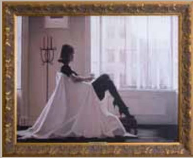
Jack Vettriano, In Thoughts of You, Offset lithograph on canvas 8th Floor Elevator Lobby