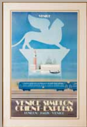
Pierre Fix-Masseau, Venice Simplon Orient Express, Poster lithograph 19th Floor Elevator Lobby