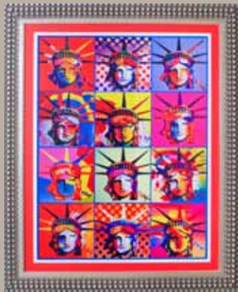
Peter Max, Liberty Justice for All, Offset lithograph 7th Floor Elevator Lobby