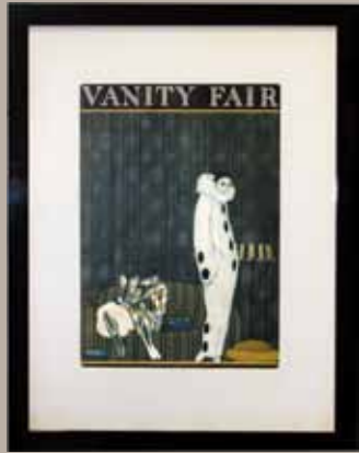
William Bolin, Vanity Fair July 1920, Reproduction illustration print 6th Floor Club Room