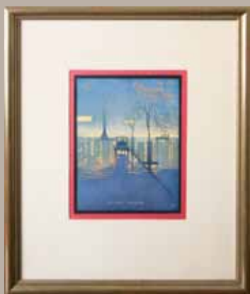
Unknown, Edison Sales Builder, April 1916, Reproduction illustration art 22nd Floor West Corridor