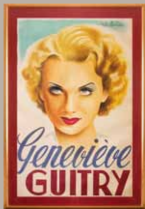
Gaston Girbal, Genevieve Guitry, Vintage movie poster lithograph 22nd Floor East Corridor