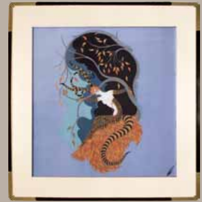
Erté, Autumn, Open edition print 11th Floor Elevator Lobby