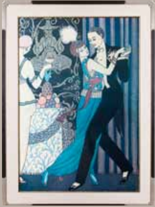
Unknown, Unknown, Vintage poster lithograph 12th Floor Elevator Lobby