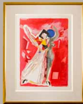
Marino Marini, La Traviata, Limited edition lithograph 26th Floor Elevator Lobby