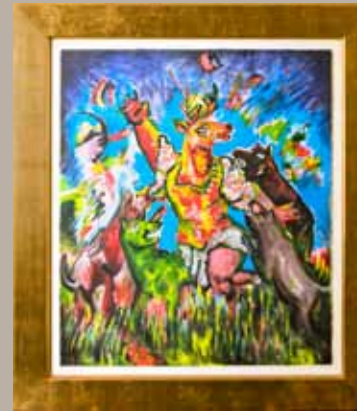
Sandro Chia, Outdoor Scene, Limited edition lithograph 24th Floor West Corridor