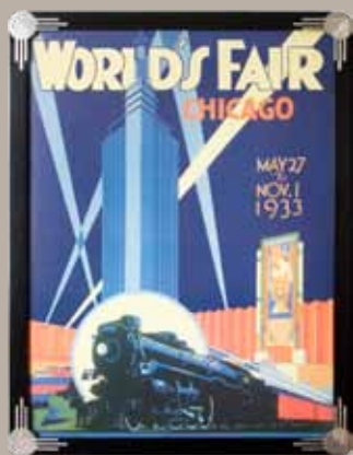
Leslie Ragan, Chicago New York Central Lines, Reproduction poster 14th Floor West Corridor