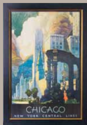
Claude van Damme, "Unicorn", Watercolor 14th Floor East Corridor