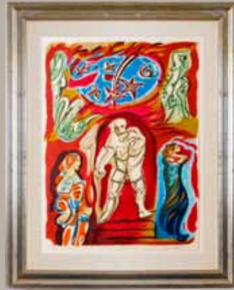
Andrè Masson, Don Giovanni, Limited edition lithograph 26th Floor West Corridor