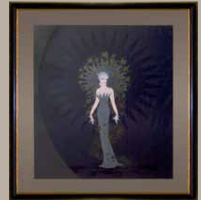
Erté, Starstruck, Serigraph 11th Floor East Corridor