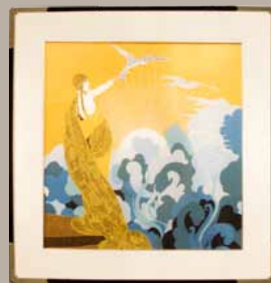
Erté, Wings of Victory, Silk scarf 1st Floor Elevator Lobby