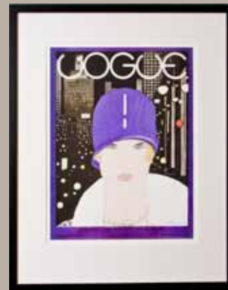
Georges Lepape, Vogue, 1927, Open edition giclee print 20th Floor Elevator Lobby