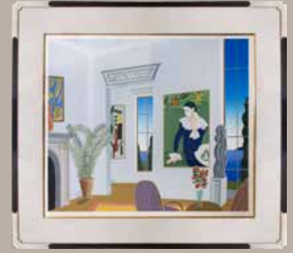
Thomas McKnight, Harlequin, Limited edition serigraph 10th Floor East Corridor