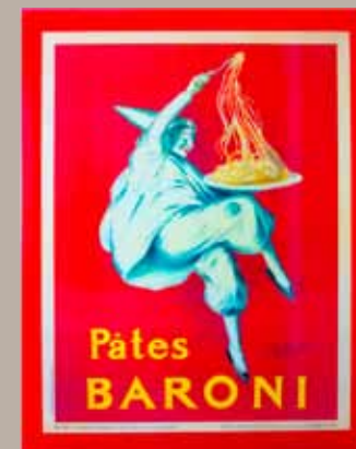
Leonetto Cappiello, Pates Baroni, Reproduction poster print 6th Floor Guest Suite