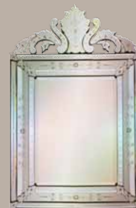
Venetian style mirror 18th Floor East Corridor