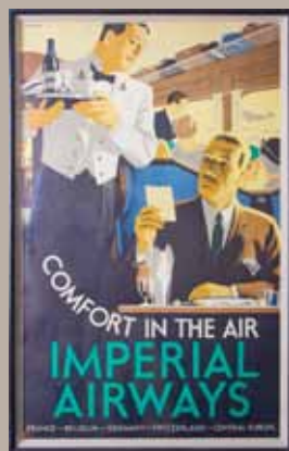
Tom Purvis, Comfort in the Air/Imperial Airways, Poster lithograph 14th Floor Elevator Lobby