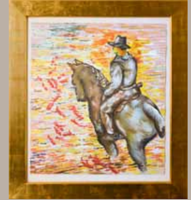
Sandro Chia, Southern Comfort, Limited edition lithograph 24th Floor Elevator Lobby