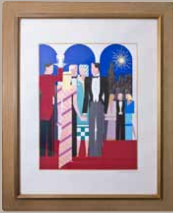
Giancarlo Impiglia, Five Arches II, Limited edition serigraph 6th Floor Elevator Lobby