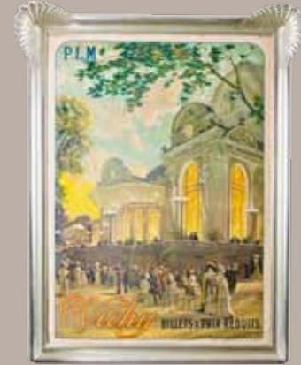
Louis Tausin, Vichy Billets A Prix Reduits, Vintage poster lithograph 17th Floor Elevator Lobby