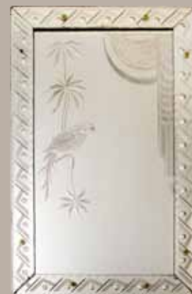
Venetian style mirror 18th Floor East Corridor