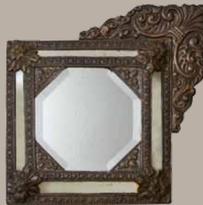
Framed mirror 18th Floor West Corridor