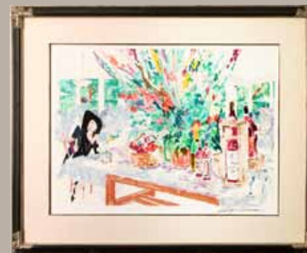
LeRoy Neiman, California Cuisine, Serigraph 23rd Floor Elevator Lobby