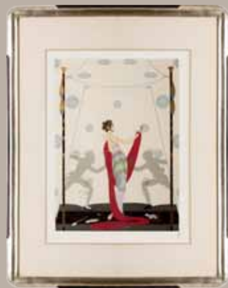
Erté, The Duel, Limited edition silkscreen 25th Floor East Corridor