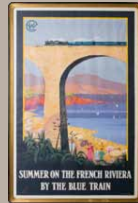
Unknown, Summer on the French Riviera, Poster lithograph 22nd Floor Elevator Lobby