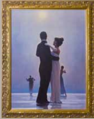
Jack Vettriano, Dance Me to the End of Love, Offset lithograph on canvas 8th Floor Elevator Lobby