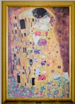
Gustav Klimt, The Kiss, Open edition lithograph 16th Floor East Corridor