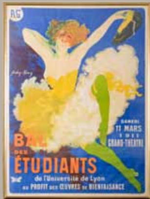
Pierre Andry-Farcy, Bal Etudiants, Vintage poster lithograph 6th Floor billiard Room