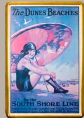
Helen Urgelles, The Dunes Beaches by the South Shore Line, Reproduction poster 22nd Floor Elevator Lobby