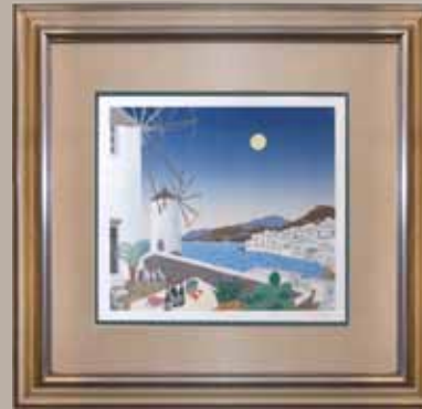
Thomas McKnight, Windmills, Limited edition serigraph 10th Floor Elevator Lobby