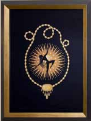
Erté, Topaz, Open edition lithograph 9th Floor Elevator Lobby