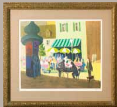
Gustav Liken, Café in Paris, Lithograph 18th Floor Elevator Lobby