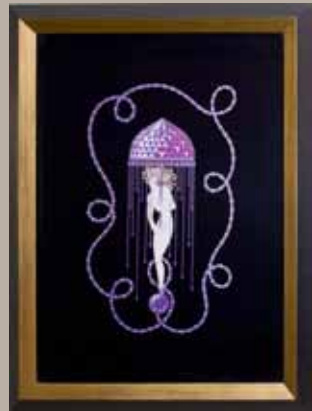
Erté, Amethyst, Open edition lithograph 9th Floor Elevator Lobby