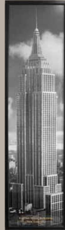
Anonymous, Empire State Building: New York 1938, Reproduction photograph