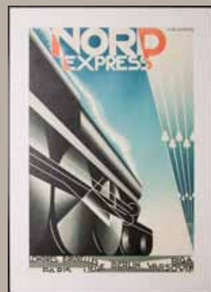
Adolphe Jean-Marie Mouron, Nord Express, Vintage poster lithograph 19th Floor West Corridor