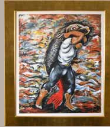
Sandro Chia, Water Bearer, Limited edition lithograph 24th Floor Elevator Lobby