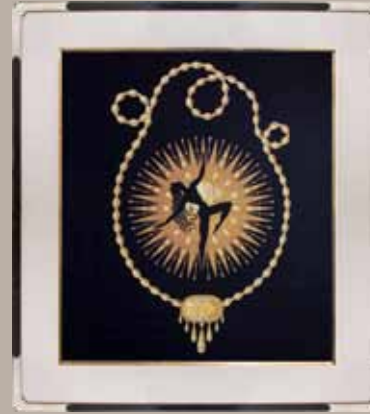
Erté, Topaz, Open edition print 11th Floor Elevator Lobby