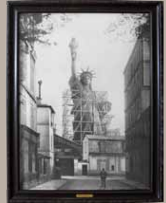
Anonymous, Statue of Liberty in Paris 1886, Reproduction photograph