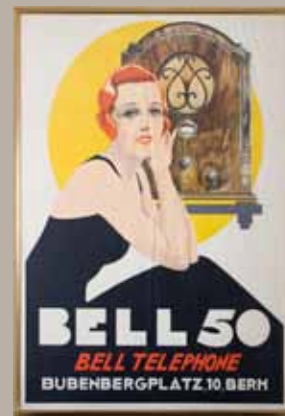
Bell 50, Vintage poster lithograph 6th Floor Club Room

Romain de Tirkhoff, later known as Erté was born in St. Petersburg, Russia and was raised with the social elite. He was educated at the Academy Julian, Paris, France where he moved when he was eighteen years old. He began working for Harpers' Bazaar in 1915. He was also well known for his fashion and theatrical costume design. He received the Officer of Arts and Letters of from the French Government in 1976 and the Legion of Honor Award in 1985. His work is in the collections of many important museums throughout the world.