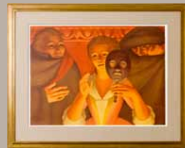
George Tooker, Un Ballo in Maschera, Limited edition lithograph 26th Floor Elevator Lobby