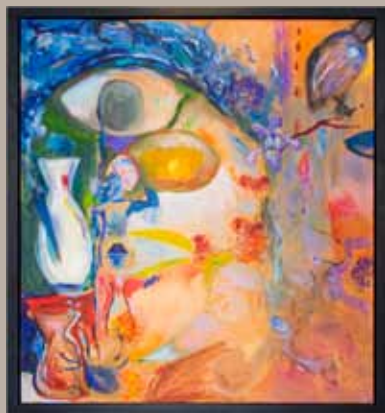
Ginny Sykes, Various Stages of Vases with Eye, Oil on Linen 1st Floor Fireplace (MI)