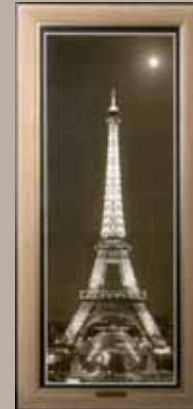
Ralf Uicker, Paris Le Tour Eiffel, Reproduction photograph 13th Floor West Corridor