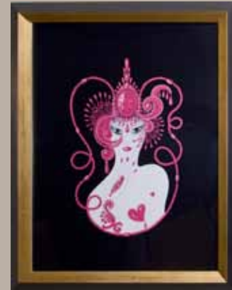
Erté, Rubies, Open edition lithograph 9th Floor West Corridor