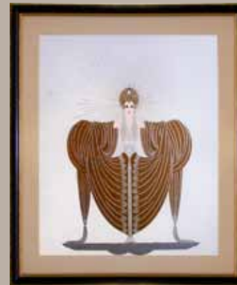
Erté, Radiance, Serigraph 11th Floor West Corridor