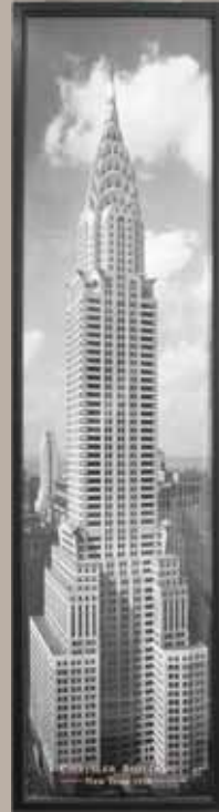
Anonymous, The Chrysler Building: New York 1938, Reproduction photograph