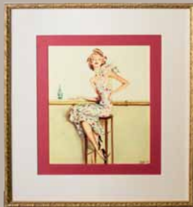
George Petty, Unknown, Open edition lithograph 22nd Floor West Corridor