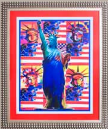
Peter Max, God Bless America, Offset lithograph 7th Floor Elevator Lobby