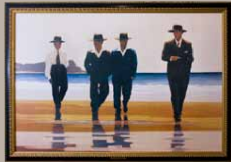
Claude van Damme, "Unicorn", Watercolor 8th Floor East Corridor