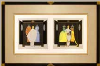
Erté, The Choice, Limited edition silkscreen 25th Floor Elevator Lobby