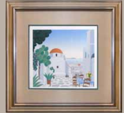
Thomas McKnight, Chapel, Limited edition serigraph 10th Floor Elevator Lobby