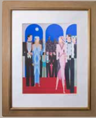
Giancarlo Impiglia, Five Arches 1, Limited edition serigraph 6th Floor Elevator Lobby