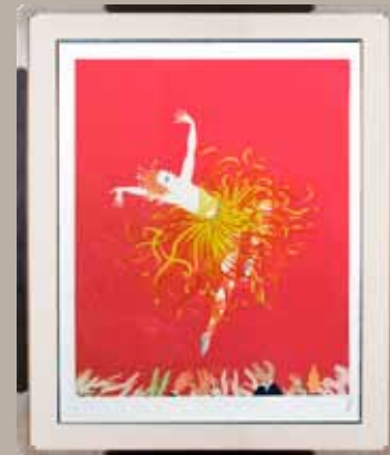
Erté, Applause, Limited edition serigraph 1st Floor Elevator Lobby