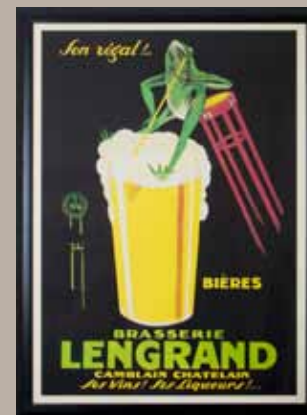
G. Piana, Brasserie Lengrand, 15th Floor Elevator Lobby