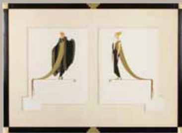
Erté, Ready for the Ball, Limited edition silkscreen 25th Floor Elevator Lobby