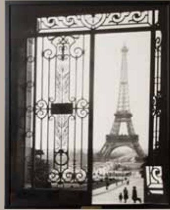
Gall, View of the Eiffel Tower, 1925, Reproduction photograph 23rd Floor East Corridor