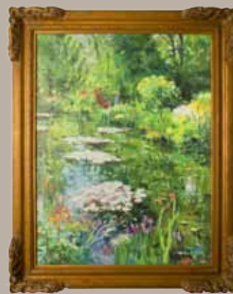
Open edition print on canvas 18th Floor West Corridor