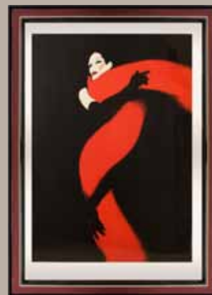
Rene Gruau, Rouge et Noir, Lithograph 15th Floor Elevator Lobby