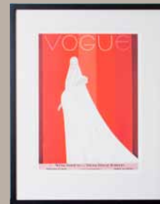
Eduardo Garcia Benito, Vogue, 1928, Open edition giclee print 20th Floor Elevator Lobby