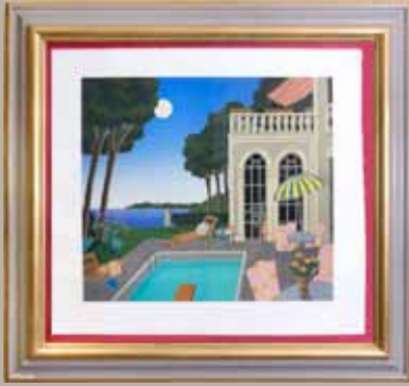
Thomas McKnight, Swimming Pool, Limited edition serigraph 10th Floor West Corridor