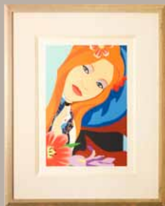
Tom Wesselmann, Lulu, Limited edition lithograph 18th Floor Elevator Lobby