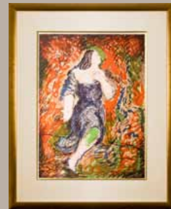
Sandro Chia, Il Trovatore, Limited edition lithograph 26th Floor Elevator Lobby