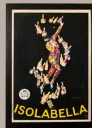
Leonetto Cappiello, Isolabella, Poster reproduction 15th Floor West Corridor