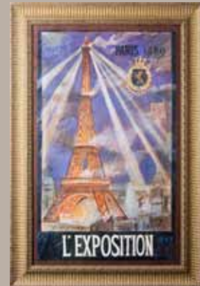
Chad Barrett, L'Exposition 1889, Open edition lithograph 13th Floor East Corridor