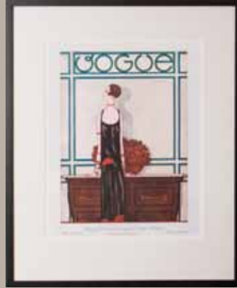
Georges Lepape, Vogue/ February 1, 1925, Open edition giclee print 21st Floor Elevator Lobby