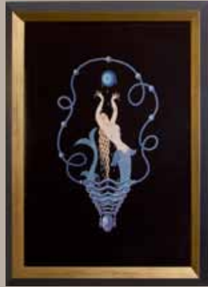
Erté, Sapphire, Open edition lithograph 9th Floor Elevator Lobby