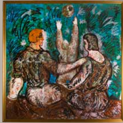
Sandro Chia, Childrens Holiday, Limited edition lithograph 26th Floor East Corridor