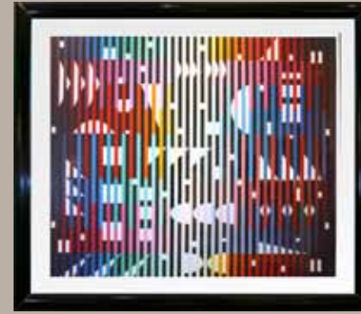
Yaacov Agam Mystic Night Rainbow, Limited edition serigraph 6th Floor Business Center