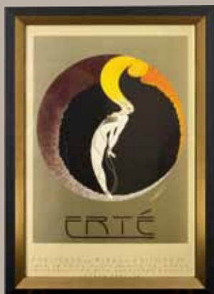
Erté, L'Amour, Lithograph on foil paper 25th Floor Corridor West