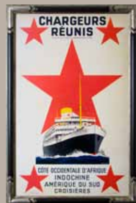
George Taboureaux, Chargeurs Réunis Indochine Amerique du Sud, Vintage poster 19th Floor Elevator Lobby